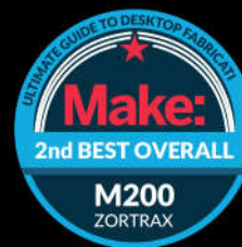
Zortrax M200 Best Overall 3D Printer 2nd Place Award